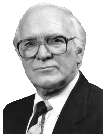
Professor Sir James Black

The Inaugural Academy of Pharmaceutical Sciences plenary lecture is kindly sponsored by AstraZeneca.